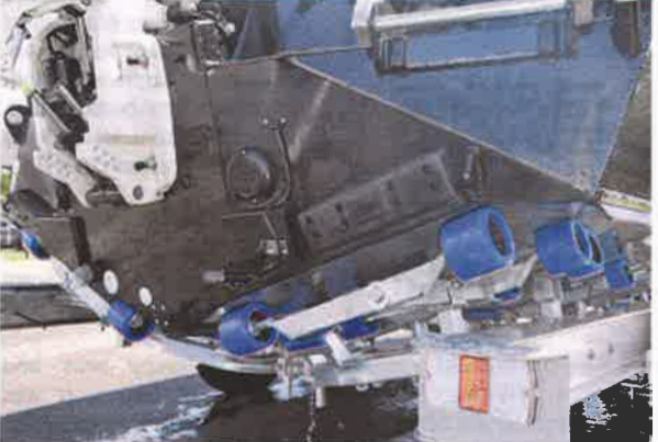
The new transom design is a lot stronger and caters for heavier and more powerful engines.

The new comfortable cabin layout features bunks from 1.7-2m in length and makes smart use of the space