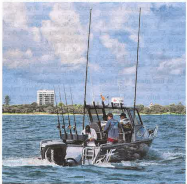
The 7400 is an absolute offshore fishing machine.

big blue. Another noticeable change is the full transom that extends to the waterline giving the boat more lift, stability and buoyancy. The transom has also been beefed up to allow for more horsepower and weight on the back.