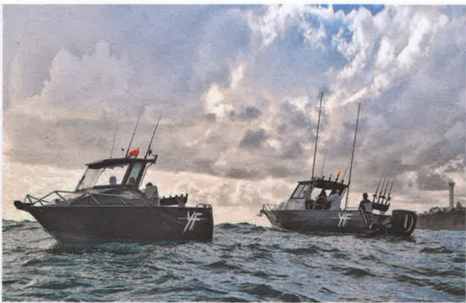
The new hull design makes these Yellowfin boats super stable at rest.

The boats are built stronger than ever with the 6200, 6700 and 7400