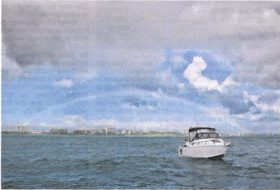
The new Yellowfin range will protect you from the elements – rain, hail or shine!