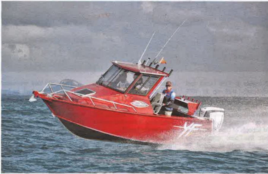
The 6200 hard top was put through the paces at the media day.

featuring 6mm plate bottom sheets (5mm for the 5800), 5mm transom material and 4mm sides. Adding to the strength is a fully welded checker plate self-draining deck with a box section floor frame. Between the